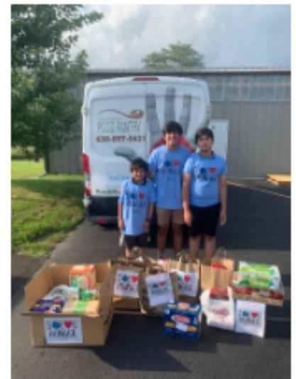
Donating food in Aurora, IL

**Solve Hunger Family is constantly connecting communities to food sources.